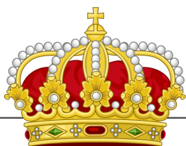
Head of Royal Correspondence